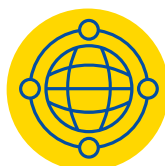
Connecting Europe Facility

In 2022, Ukraine already joined Digital Europe , Fiscalis , Customs , EU4Health and LIFE programmes.