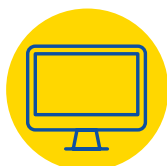
Single Market Programme (SMP)

Ukraine will join other key EU funding programmes which will help Ukraine further benefit from cooperation with EU and align its acquis on key areas: